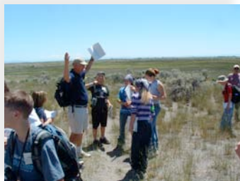
The Rocky Mountain Adventure Science camp